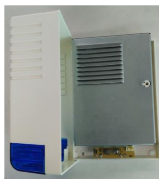
Internal Metal Protection