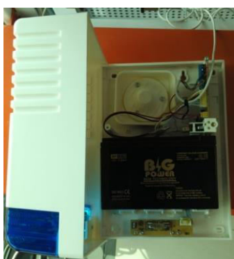
Backup Battery 12V 7AH