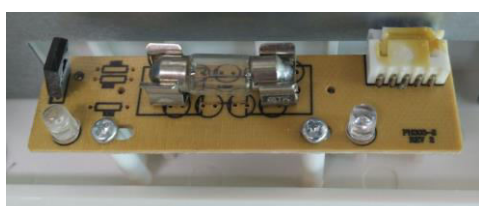
Bulb Lens Alarm Twin Alternating LEDs