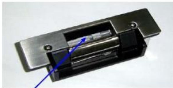
Door Status Signal ( Micro Switch )